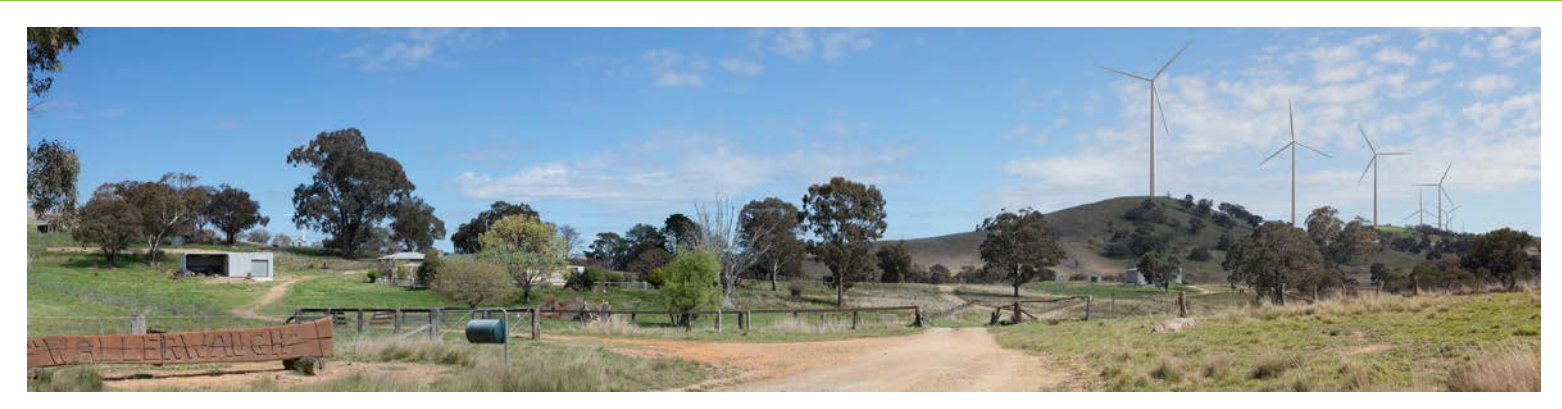
Photomontage of what the wind farm would look like from Wallawaugh Rd, Hargraves, approximately 2 km away.